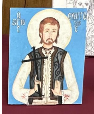
Evangelos Agganis Oratorical Festival 1 st Place Icon