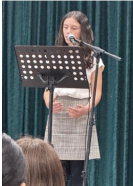
Nicoletta Gianakopoulos Oratorical Festival 2024